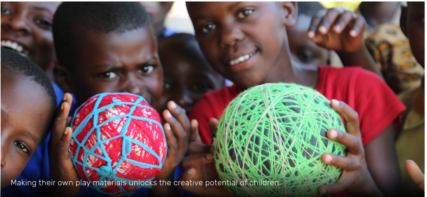
Making their own play materials unlocks the creative potential of children.

In 2018, Right To Play launched the Gender Responsive Education And Transformation (GREAT) program with the financial support of the Government of Canada provided through Global Affairs Canada. Active in three countries, Ghana, Mozambique and Rwanda, GREAT uses Right To Play's play-based learning approach to remove barriers to education, especially for girls, and to build teacher capacity to improve learning outcomes.